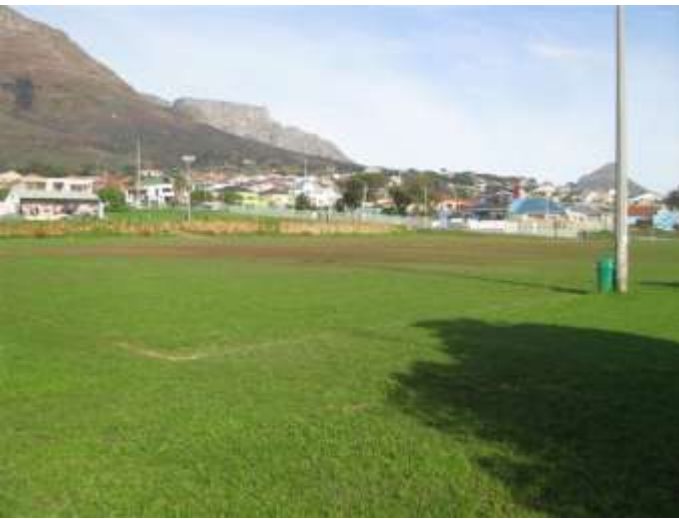
East View Table Mountain

The condition of football pitch is also poor but Council has budgeted for a re-surface. This will take place from October.