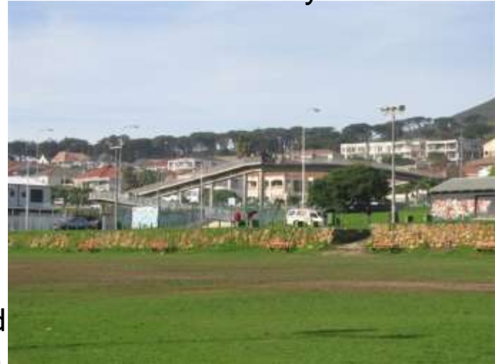
Poor condition of pitch

They have recently installed security fences around the complete field with gates.