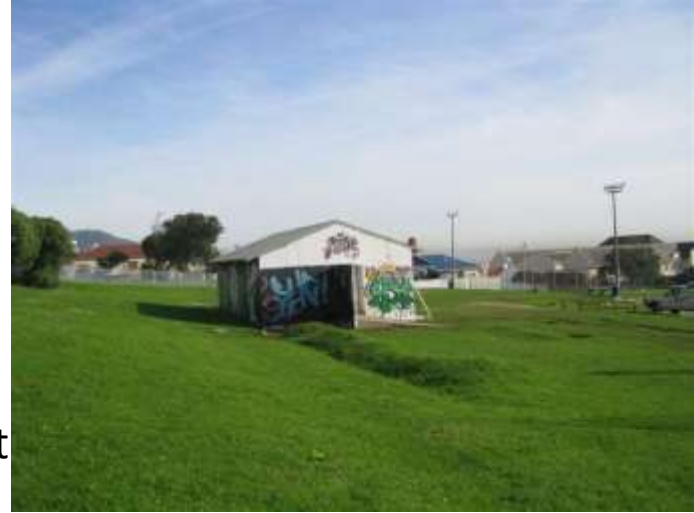
Club House facility

The Club House as it is presently is in need of paint and repair, but is utilized to its maximum.