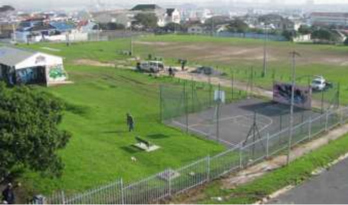
North View across Table Bay

Easily accessible by road or foot from Woodstock Salt River and surrounds,